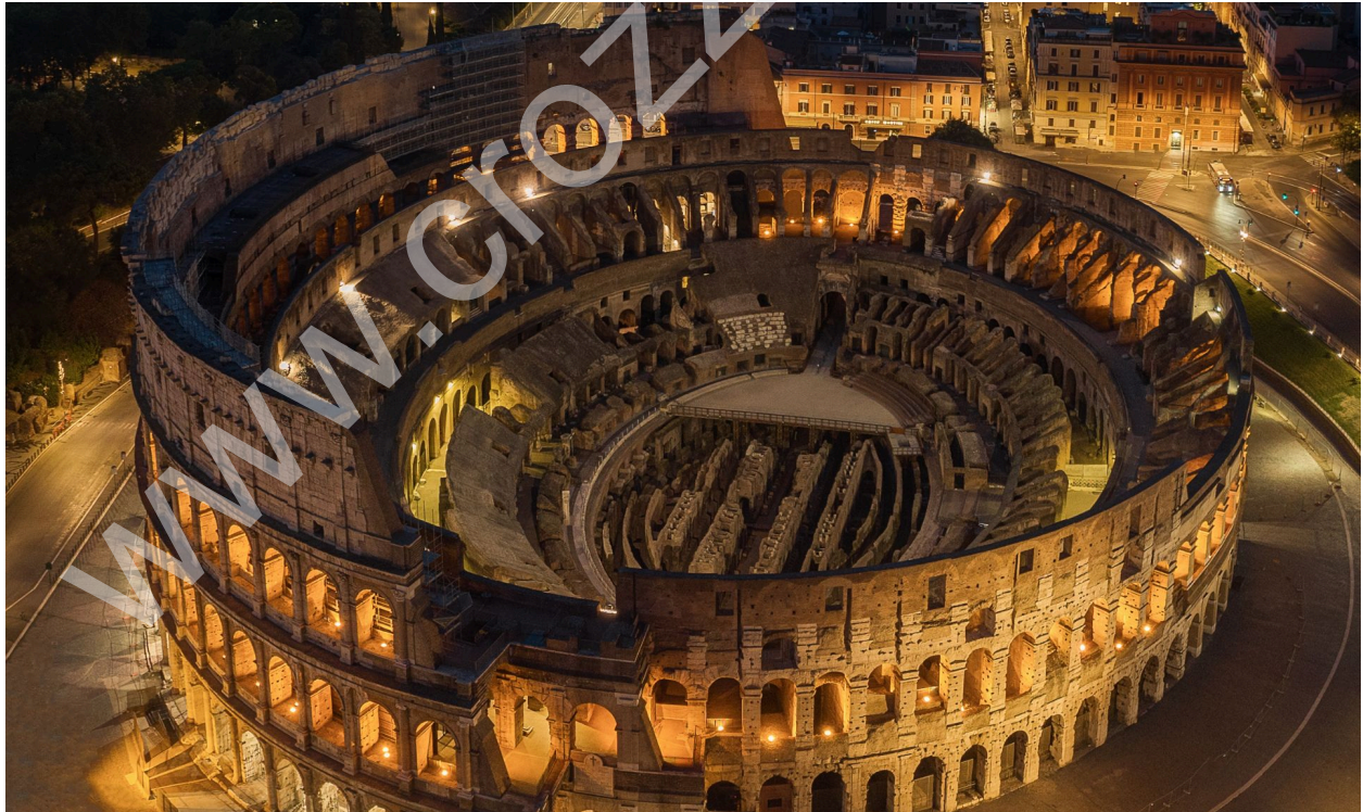
Colosseum 70 A.D, Rome Italy.

The symbolic coincidence of the Colosseum and an eye, merits we study this time in history and how the jewish people play a key role in what is known as the coming "Messianic Age".