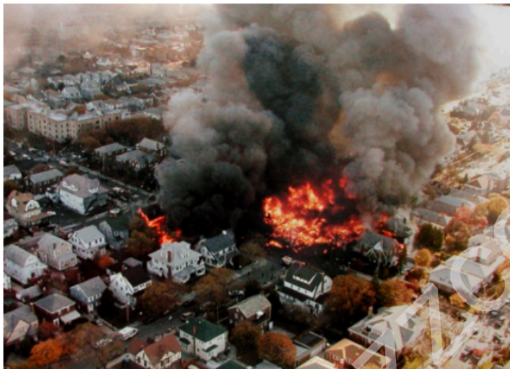
Fires burning in New York's Rockaway neighborhood, from the crash of American Airlines Flight 587 that killed 265 people, are visible from a police helicopter.

(Originally published by the Daily News on November 13, 2001.)