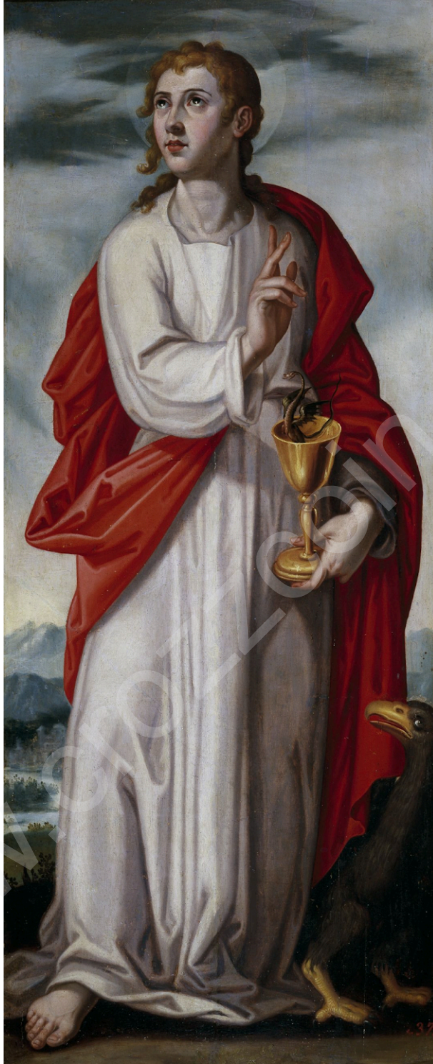
Saint John the Evangelist, Francisco Pacheco 1608.

Pacheco depicted his painting of Saint John holding the Holy Grail with what seems like a lizard-like creature in it.