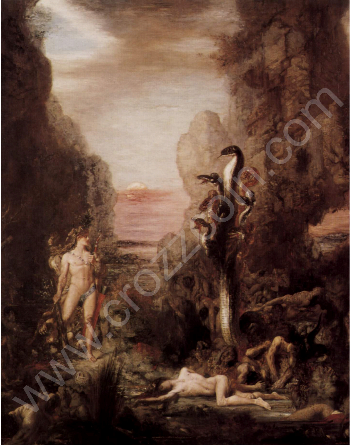
Gustave Moreau 1861.