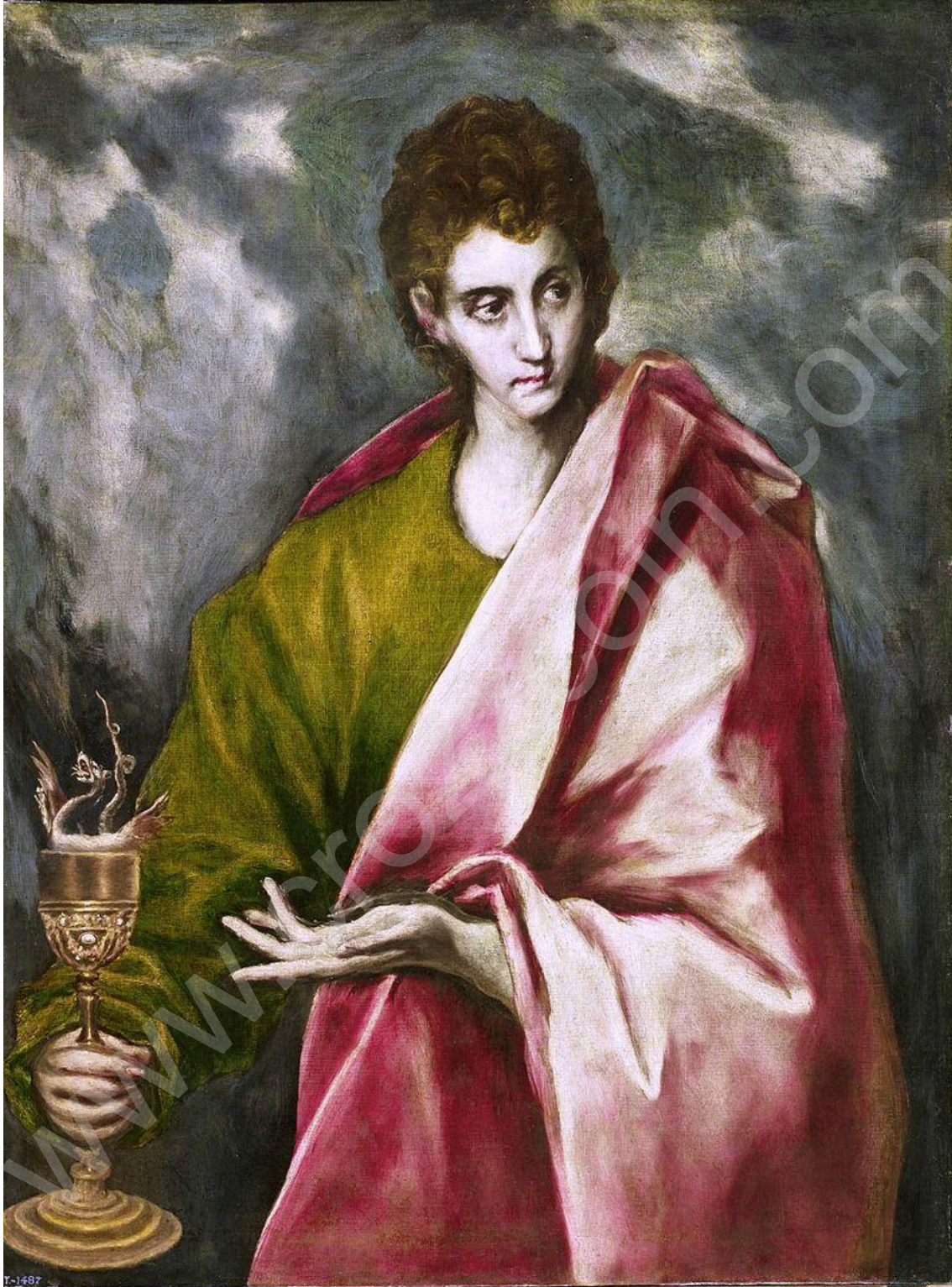
Saint John the Evangelist, El Greco (Domenico Theotokopoulos) 1541-1614.