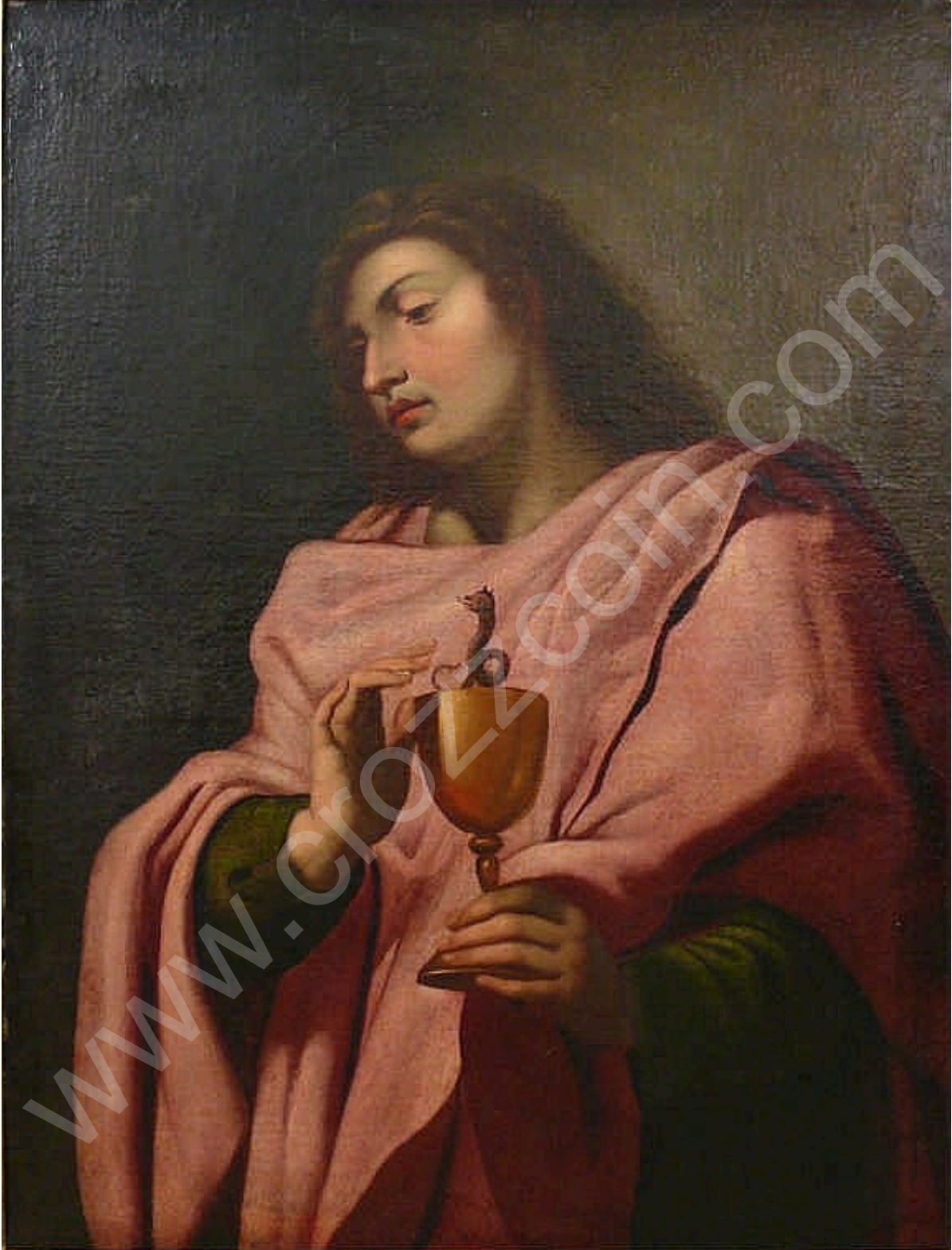
Saint John the Evangelist, Abraham Jansens 1575.

All these grand masters depict Saint John wearing a red robe.