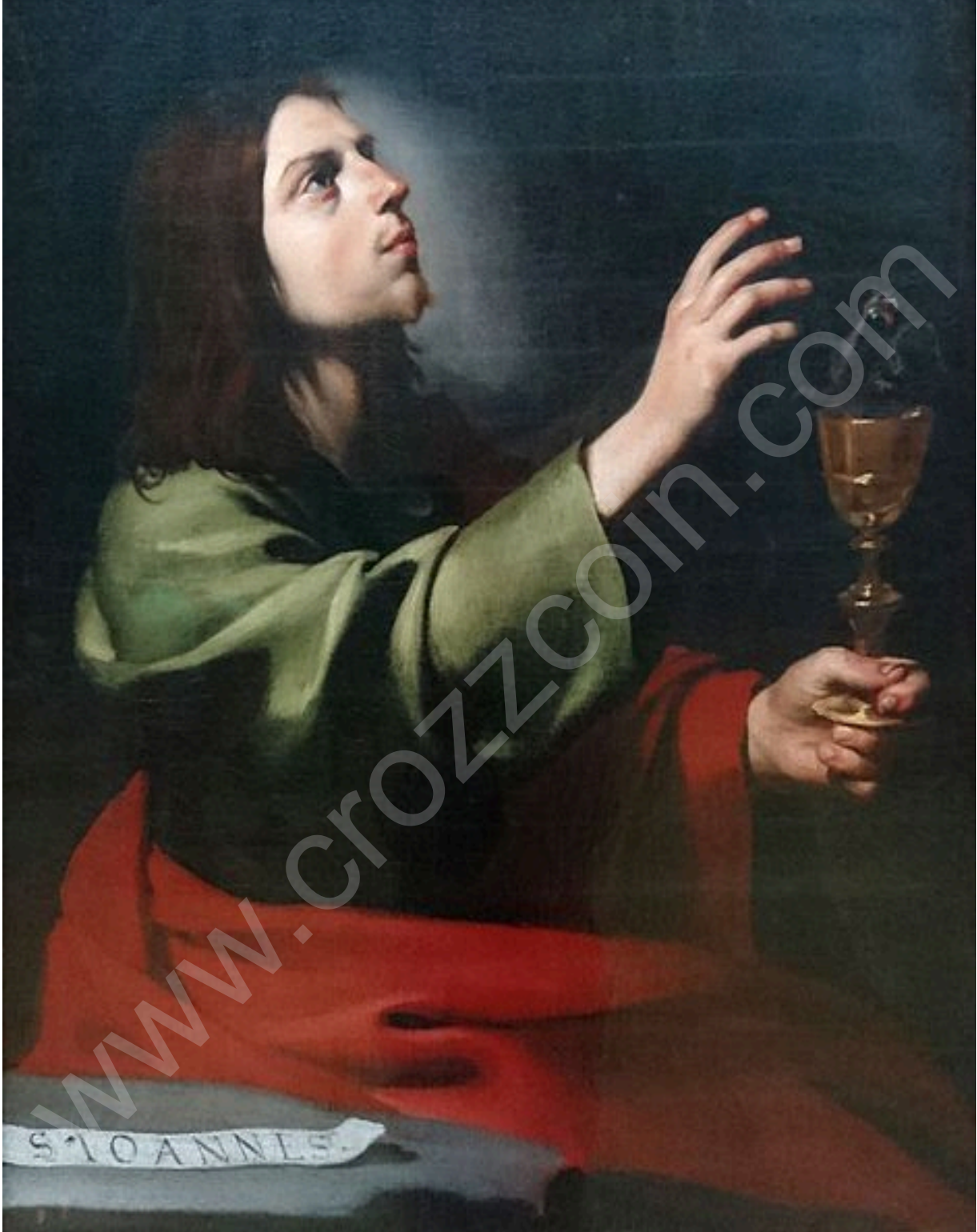
Saint John the Evangelist, Jusepe de Ribera 1607.

In de Ribera's work, Saint John holds the Holy Grail in a very specific manner.