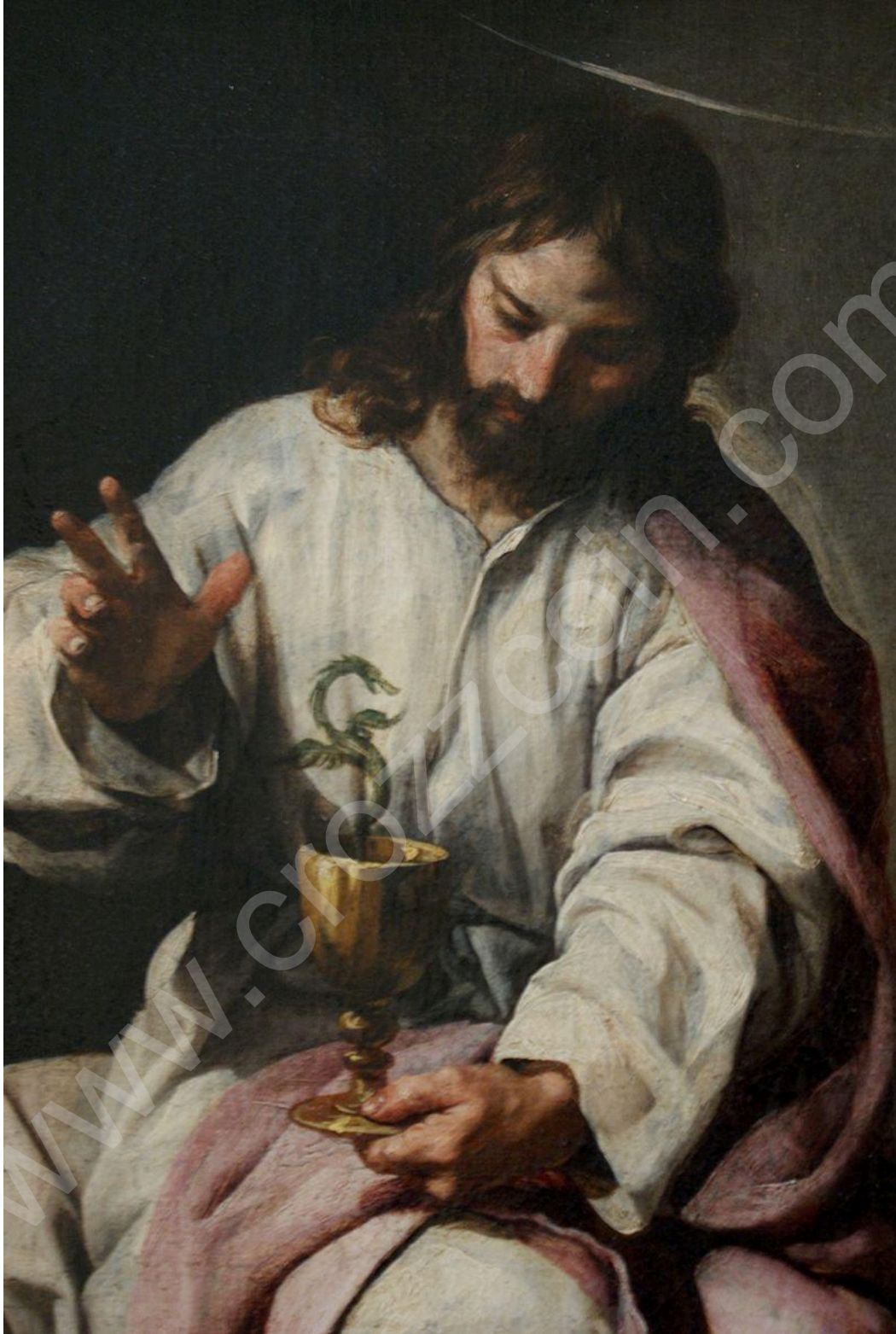
Saint John the Evangelist, Alonzo Cano 1635.

Cano's depiction of Saint John follows the same pattern as Pacheco's and de Zurbaran's work.