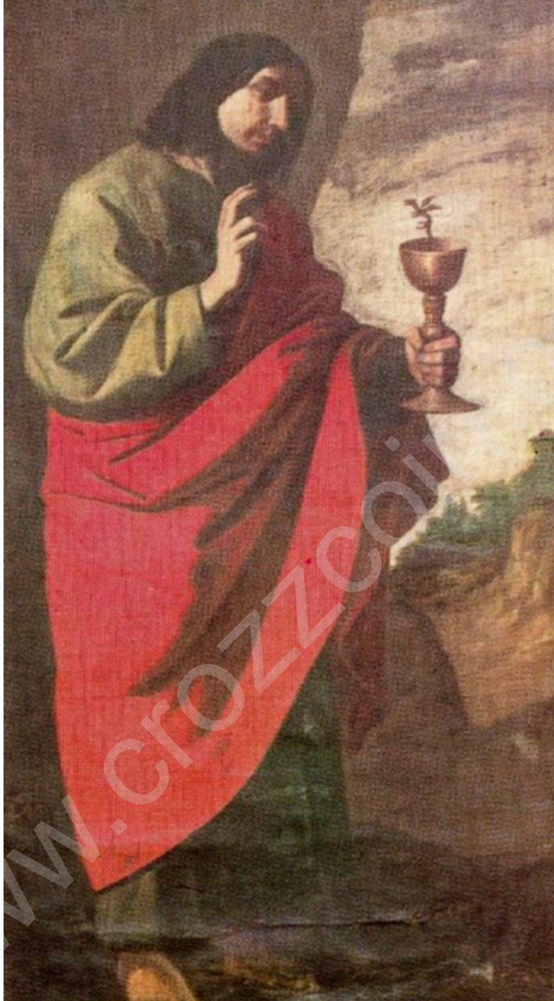
Saint John the Evangelist, Francisco de Zurbarán 1598-1664.

De Zurbarán's work also includes the Holy Grail and a "winged" creature in it; in both paintings, Saint John seems to be holding two fingers.